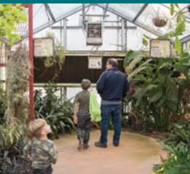
Incredible Journey: Bugs | Opens Dec 1