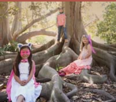
Fairies vs. Trolls Spring 2020