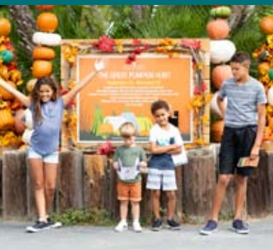
The Great Pumpkin Hunt | Through Nov 30