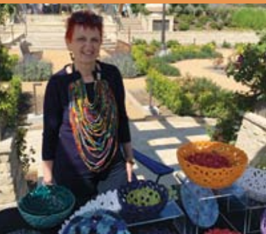
Spring Art Festival April 18-19