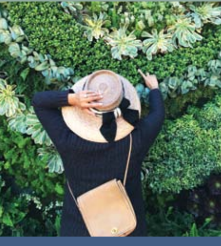
26300 Crenshaw Boulevard Palos Verdes Peninsula, CA 90274

So much is happening at YOUR Garden , from art exhibits to intriguing programs to stunning horticultural displays. Don't miss a minute of it. Renew today!